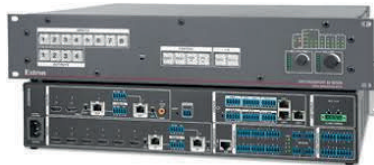
Extron DPT Cross Point